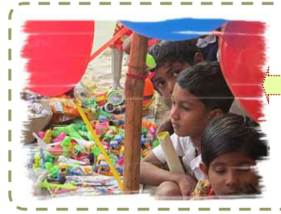
Children in a toy stall