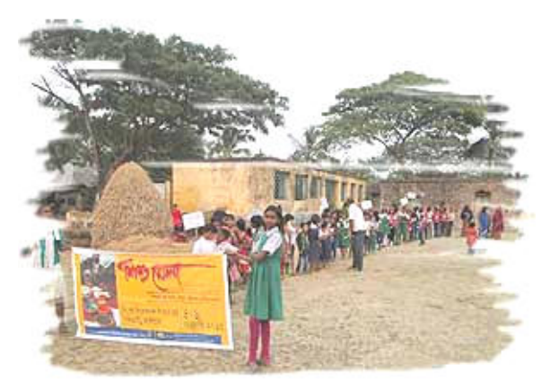
A rally to ban child labour...