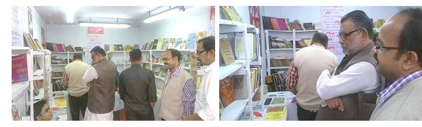
The Grace Presence... Hon'ble Minister, Dept. of Agriculture, West Bengal, Mr. Purnendu Basu at DRCSC stall