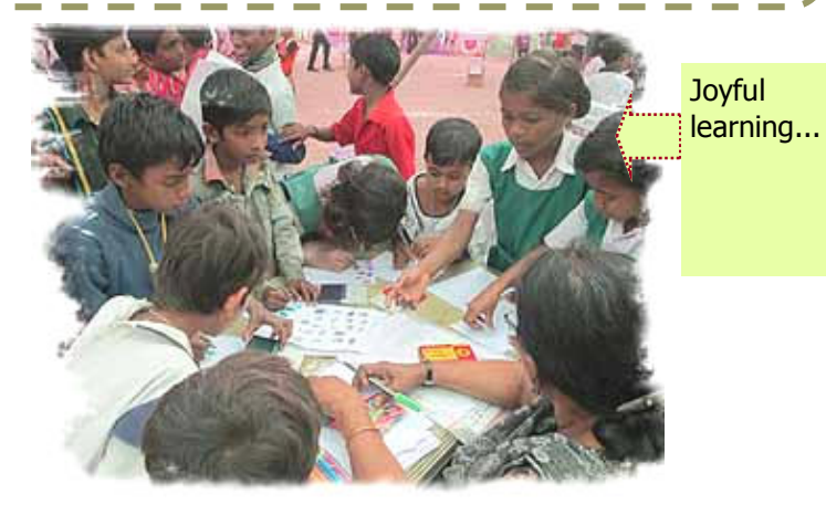
Joyful learning in a Education Stall...