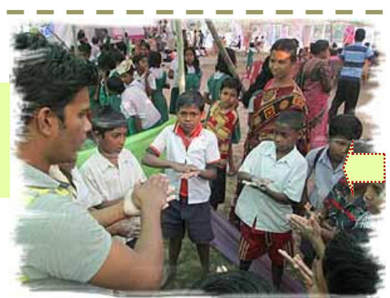
Demonstration on hand washing