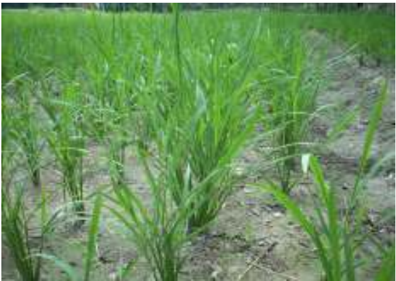
Tillering stage (8 tillers)