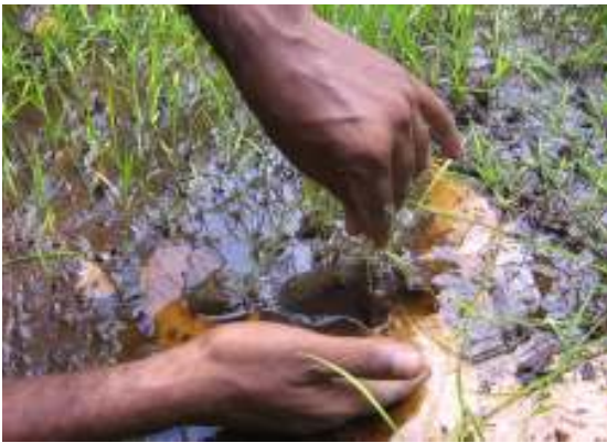
Collection of seedlings from seed bed