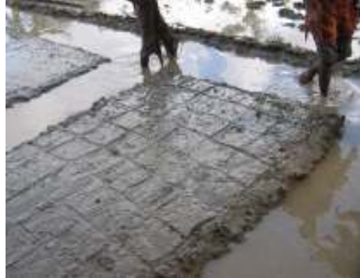
10" x 10" marking on the bed