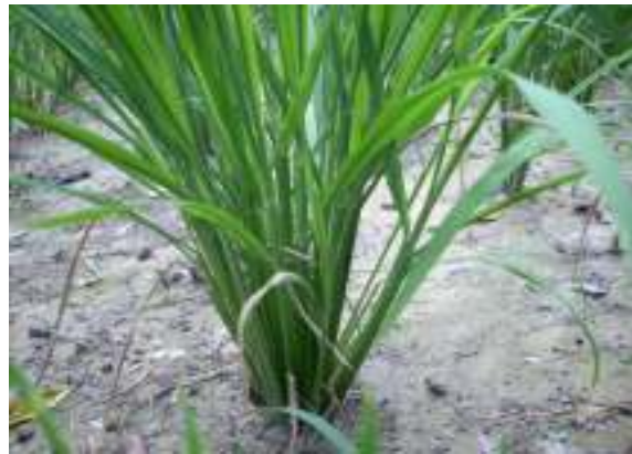
Tillering stage (30 tillers)