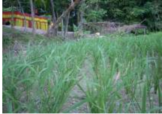
Growing stage of plant