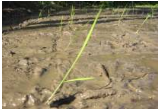
Seedlings at 45° angle