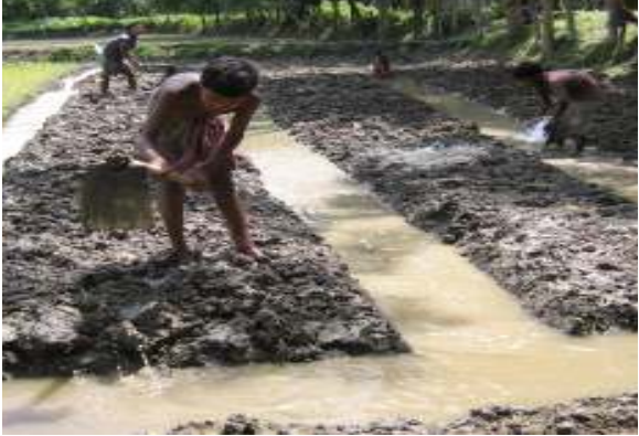
Preparation of bed