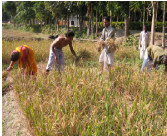
Harvesting of paddy